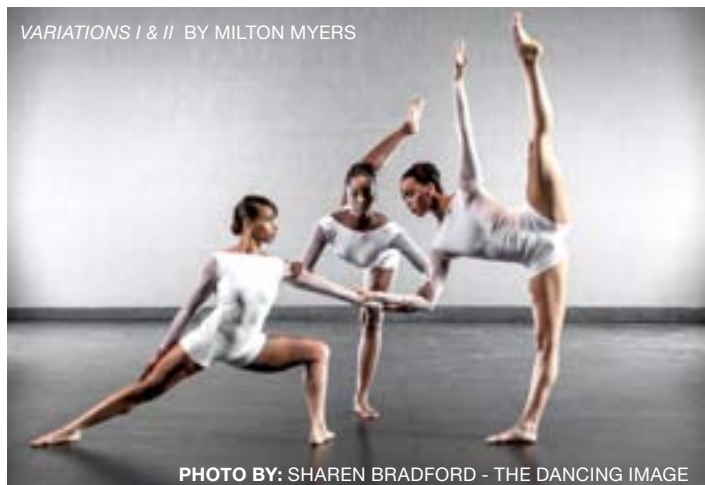
VARIATIONS I & II BY MILTON MYERS

This work was originally commissioned by The Joffrey Ballet for their full evening ballet, BILLBOARDS . The section Slide is performed to four of Prince's songs Computer Blue , I wanna Melt with U , The Beautiful Ones , and Realease It . This section capitalizes on what the LA Times called, "bold artful contrasts in dynamics and emotion".