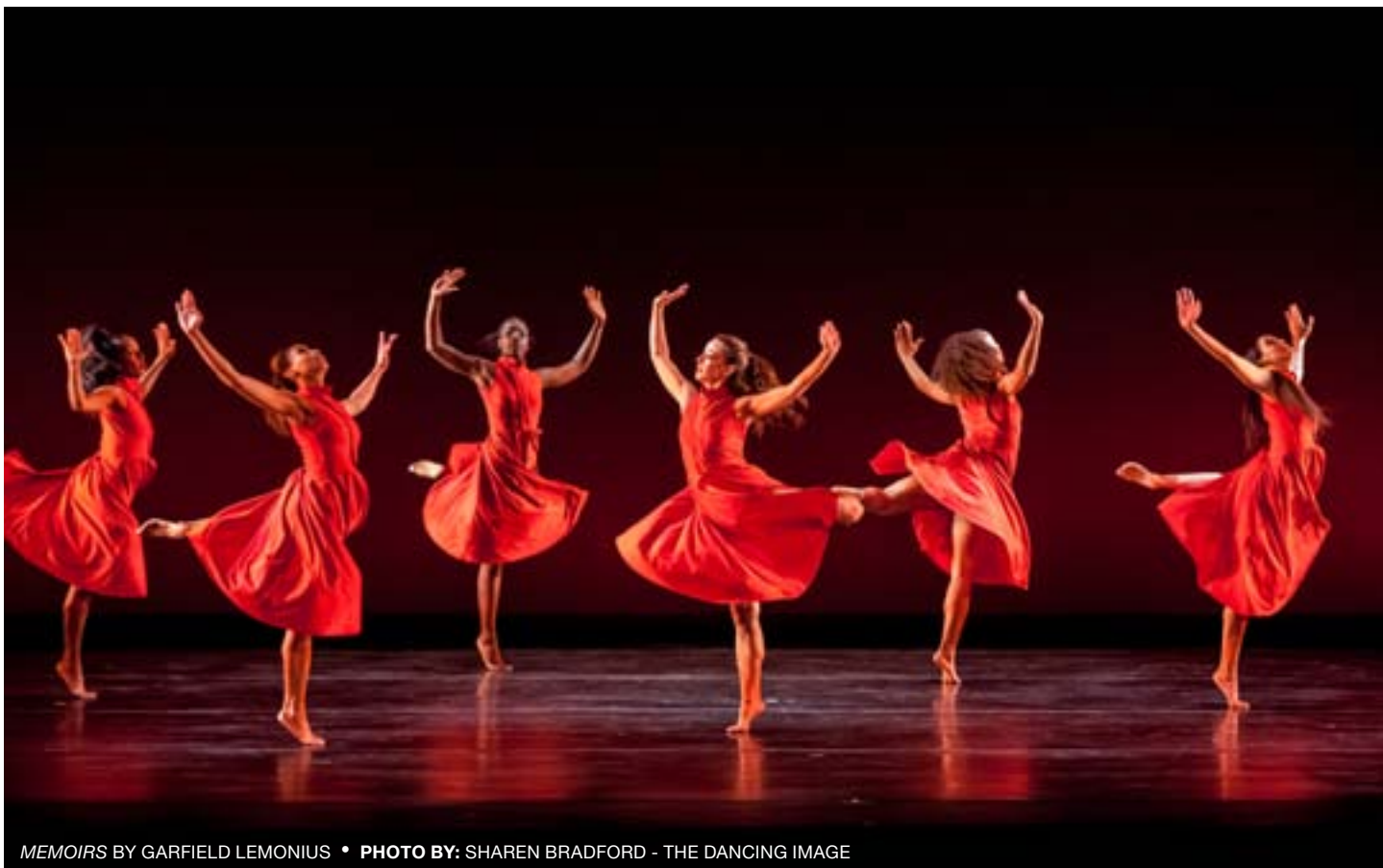
MEMOIRS BY GARFIELD LEMONIUS