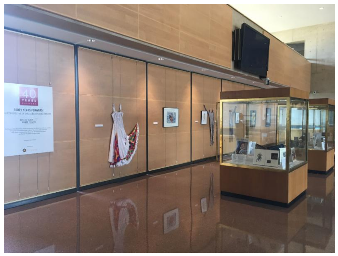
Dallas Black Dance Theatre 40 Years Forward Archive Exhibition at Dallas City Hall.