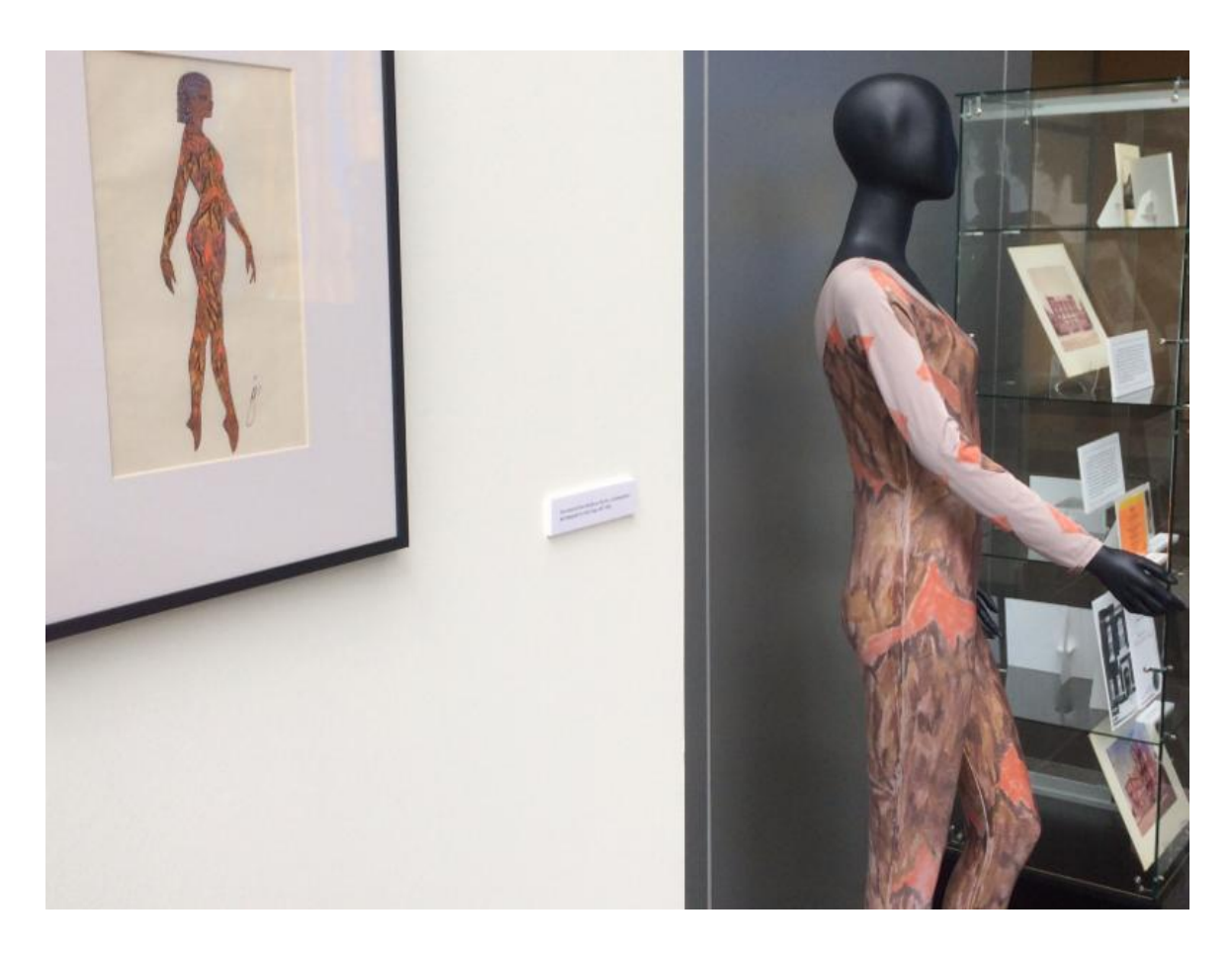
Dance costume sketch and final costume in Dallas Black Dance Theatre 40 Years Forward Archive Exhibition Tour at One Arts Plaza.