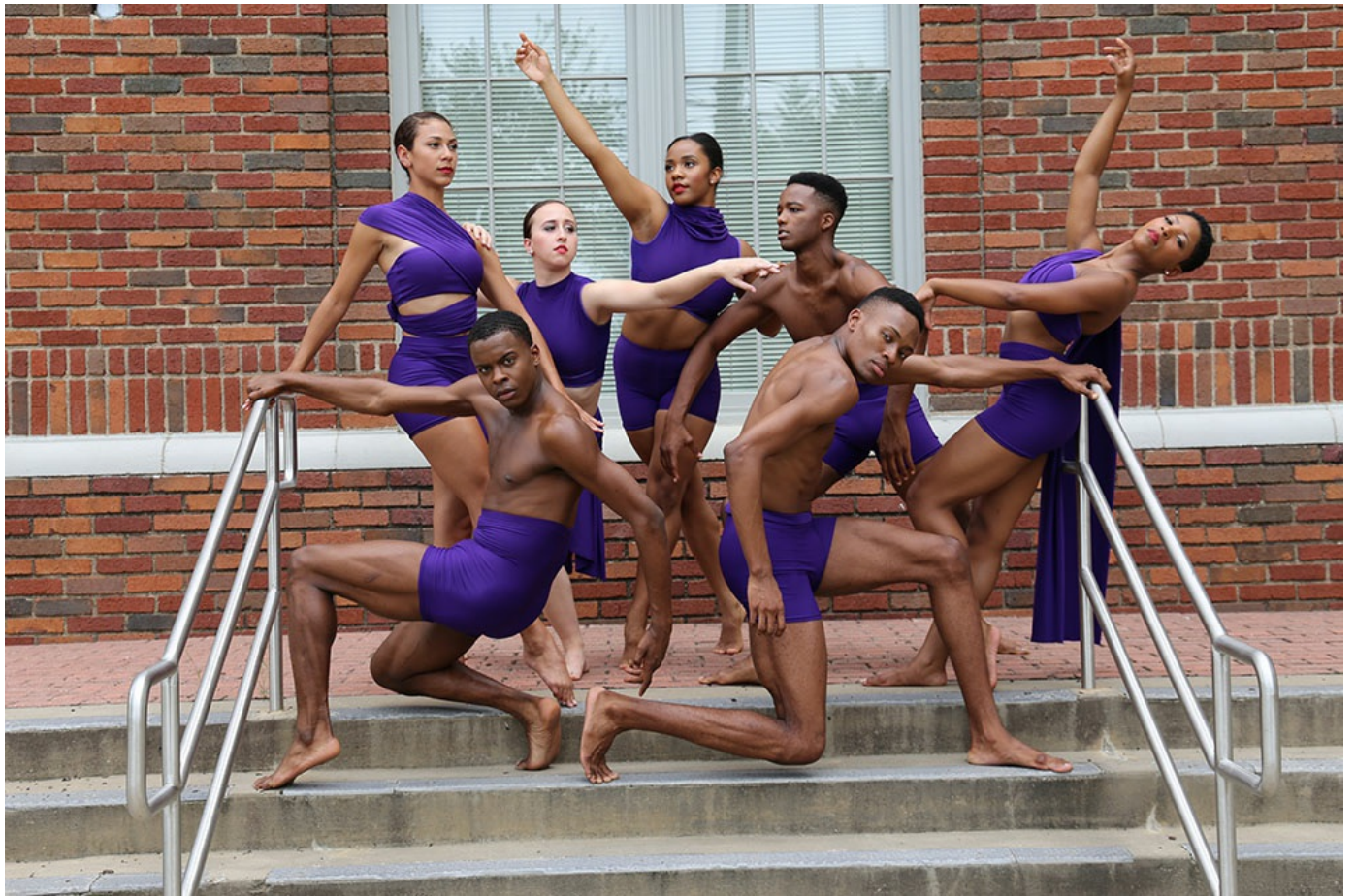
DBDT: Encore! company