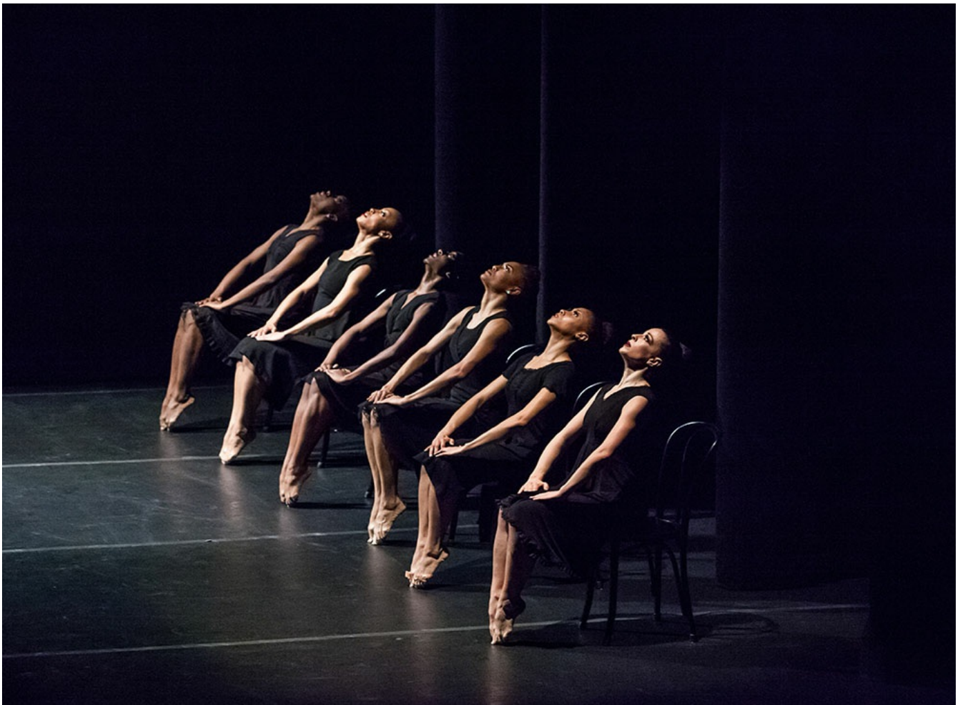
DBDT dancers in Vespers by choreographer Ulysses Dove.

Right click to copy or save photographs. If you need a higher resolution photograph please contact Ramona Logan. Contact info above.