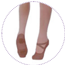
Tan Ballet Slippers