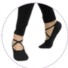
Black Ballet Shoe (Male)

Dance wear stores familiar with our dress code are: