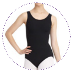
Capezio Style TB142

Please contact the Academy office for questions about attire at: (214) 871-2387.