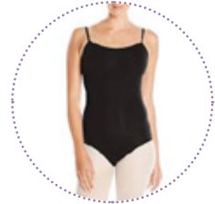
Capezio Style CC864W