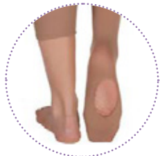
Tan Convertible Tights