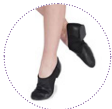
Black Slip-On Jazz Shoes