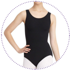
Capezio Style TB142

Please contact the Academy office for questions about attire at: (214) 871-2387.