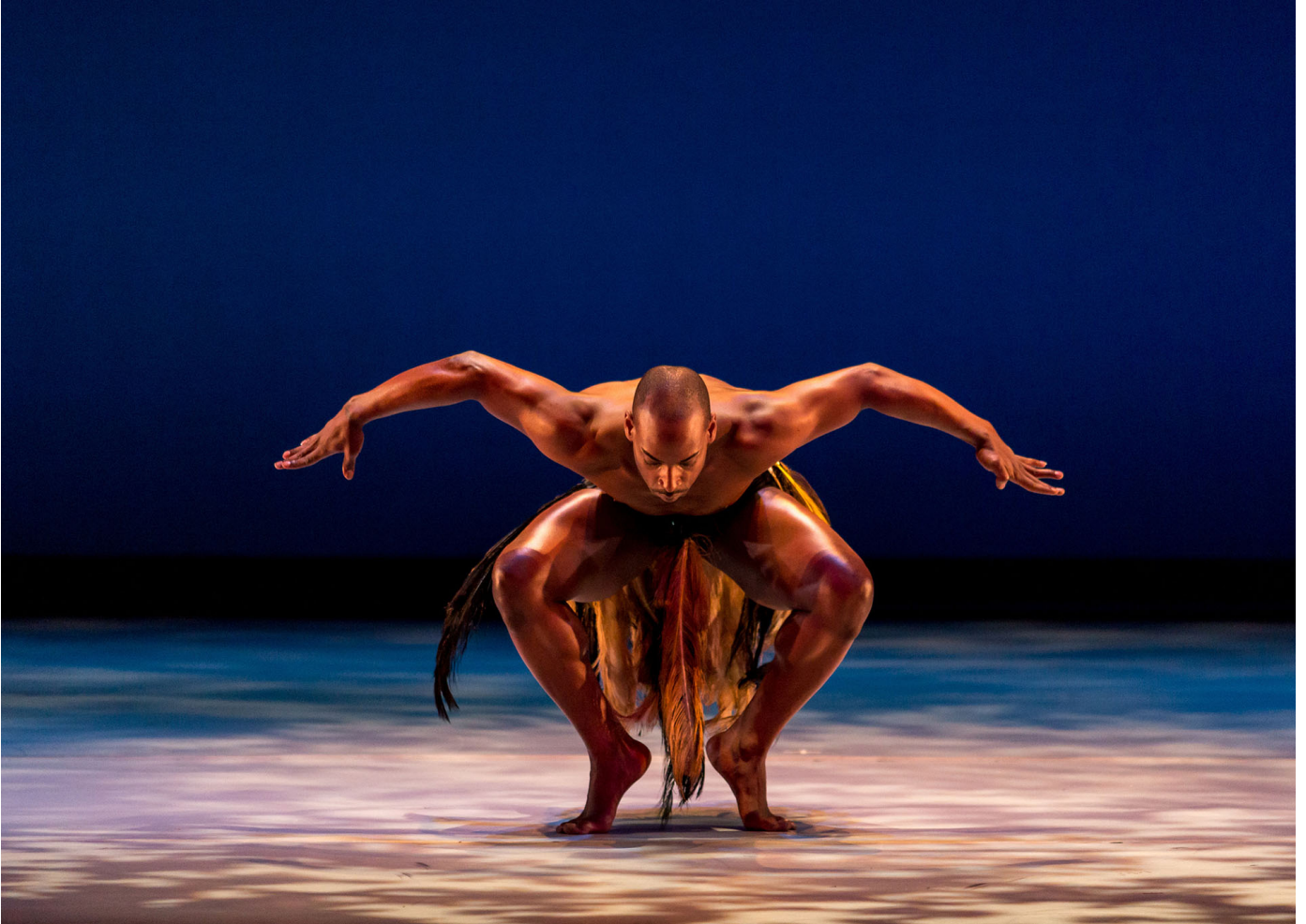
Photograph of Awassa Astrige/Ostrich by Sharen Bradford - The Dancing Image.