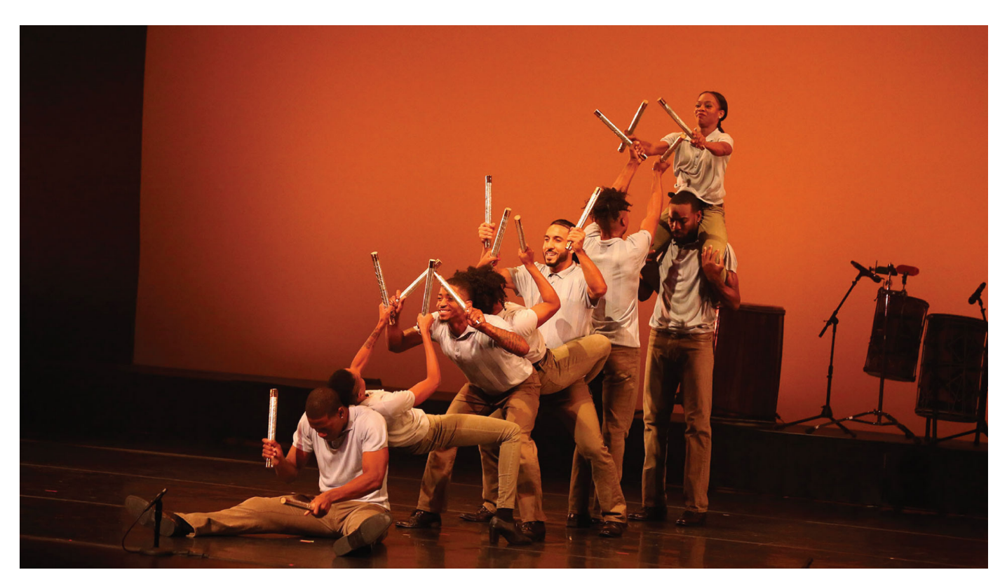
Step Afrika!