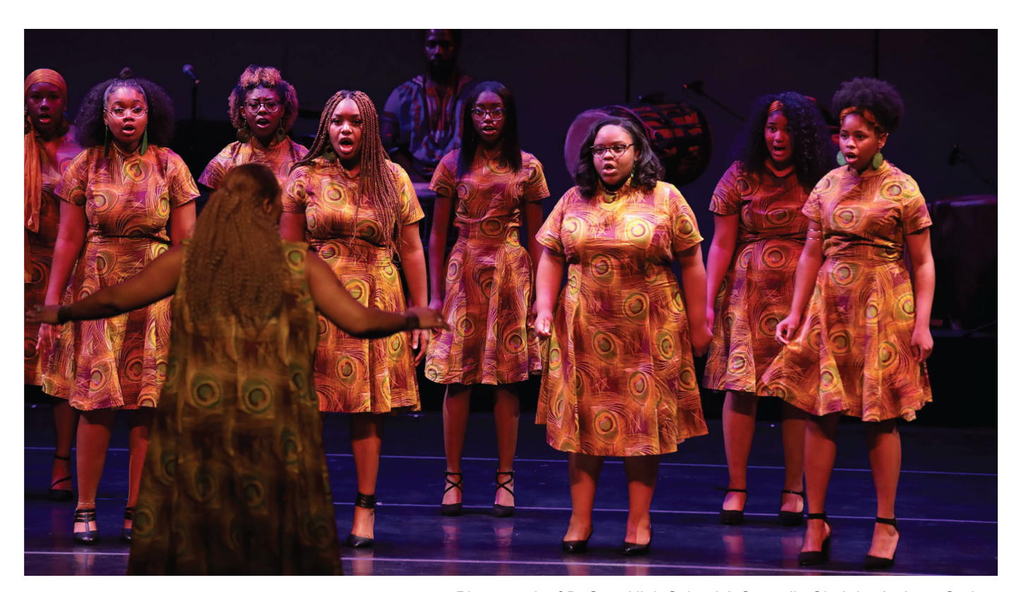
Photograph of DeSoto High School A Cappella Choir by Amitava Sarkar.