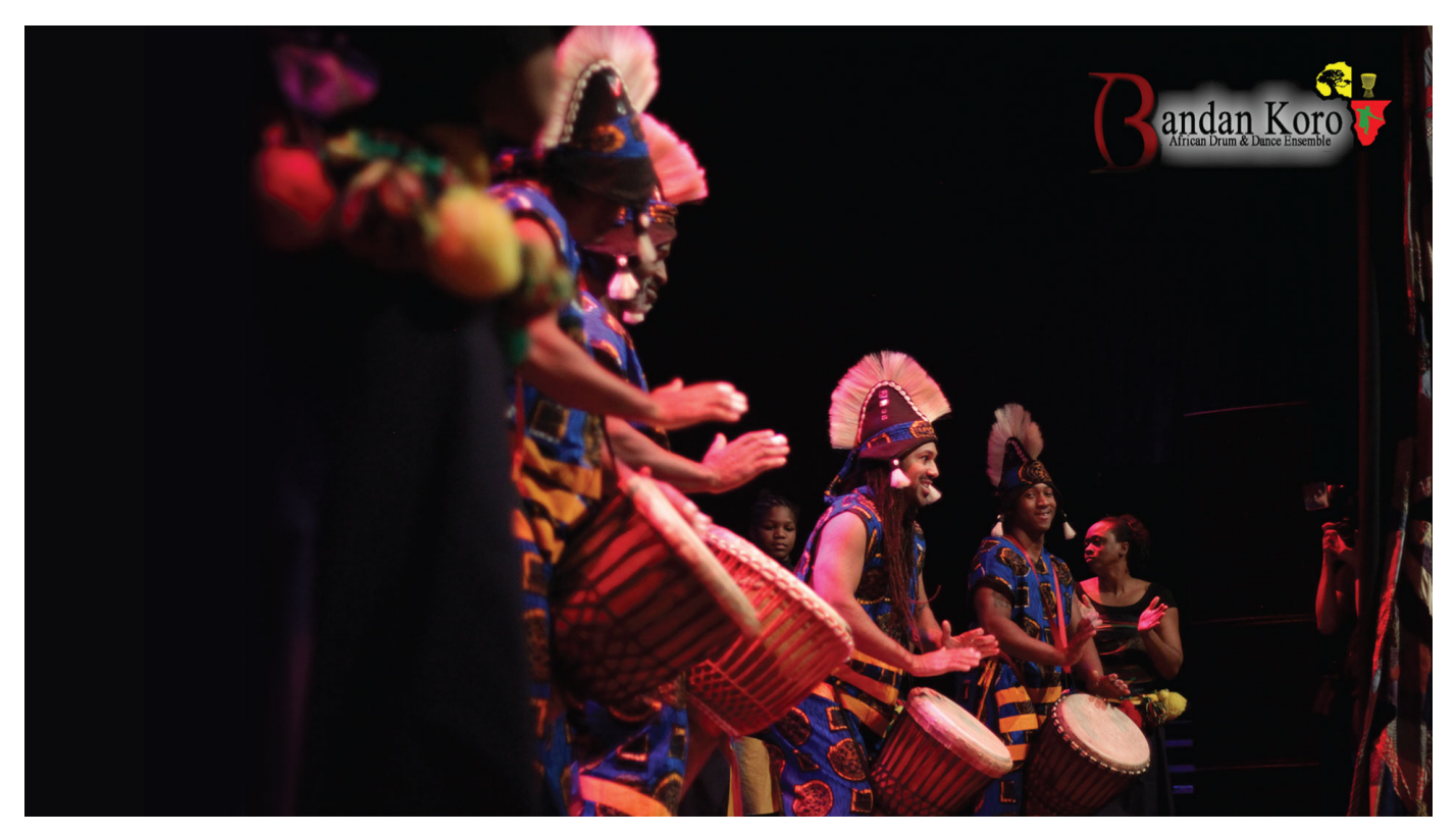
Photograph of Bandan Koro African Drum and Dance Ensemble courtesy of House of Blues.