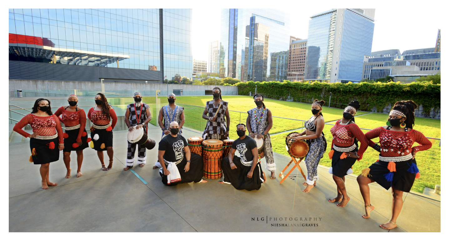
Bandan Koro African Drum and Dance Ensemble