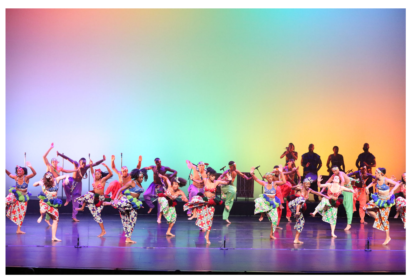
DanceAfrica photograph by Amitava Sarkar.

For more details, visit www.DBDT.com and www.dbdt.com/academy.