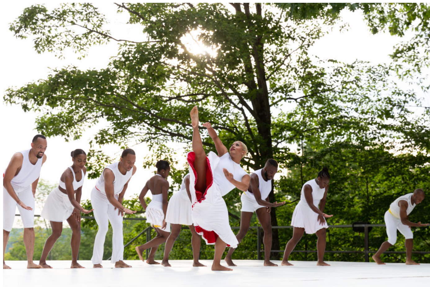
LIKE WATER

For more details, visit www.DBDT.com and www.dbdt.com/academy .