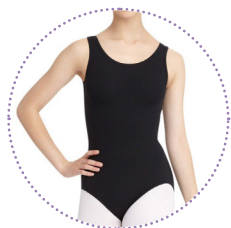
Capezio Style TB142

Please contact the Academy office for questions about attire at: (214) 871-2387.