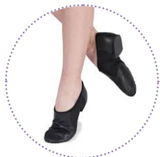
Black Slip-On Jazz Shoes