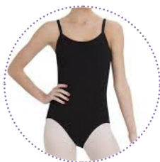
Capezio Style CC110