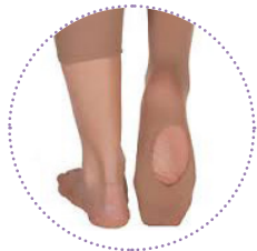
Tan Convertible Tights