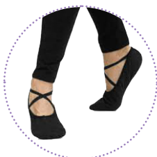
Black Ballet Shoe (Male)

Dance wear stores familiar with our dress code are: