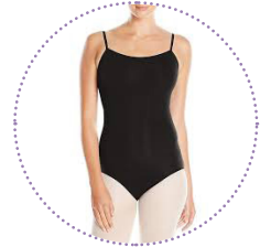
Capezio Style CC864W