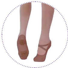
Tan Ballet Slippers