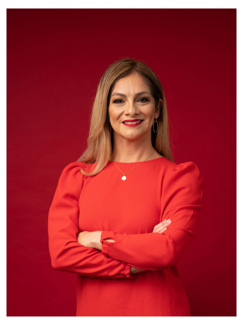
Photograph of Veronica Torres-Hazley by Alpha Business Images