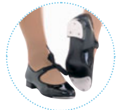
Black Tap Shoes