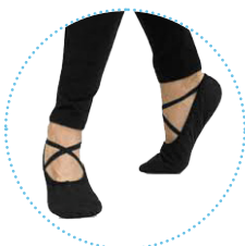
Black Ballet Shoe (Male)

Dance wear stores familiar with our dress code are: