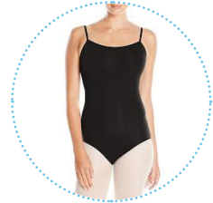
Capezio Style CC864W