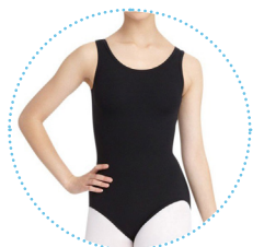
Capezio Style TB142

Please contact the Academy office for questions about attire at: (214) 871-2387.