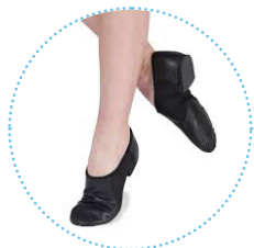
Black Slip-On Jazz Shoes