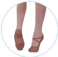
Tan Ballet Slippers