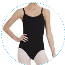
Capezio Style CC110