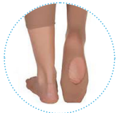
Tan Convertible Tights